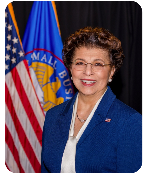
Administrator Jovita Carranza

Upon a request received from a state's or territory's Governor, SBA will issue under its own authority an Economic Injury Disaster Loan declaration*